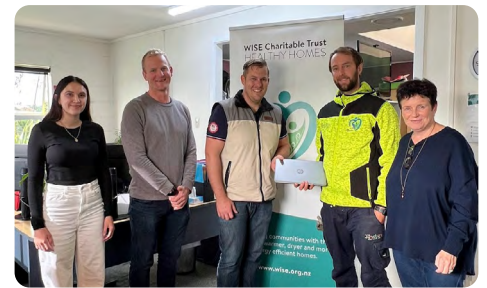
Laptops gifted to WISE Charitable Trust, Waitara

The offer was very well received, with the technology hugely appreciated by many – check out some of those grateful smiles!