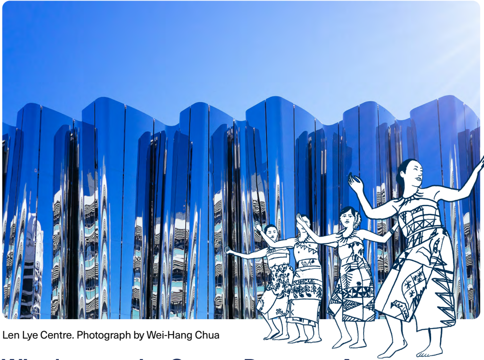
Len Lye Centre.