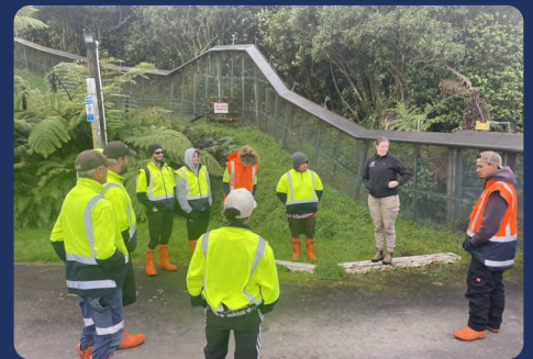
Some of the Tupu ā Nuku taura on recent their visit to Lake Rotokare