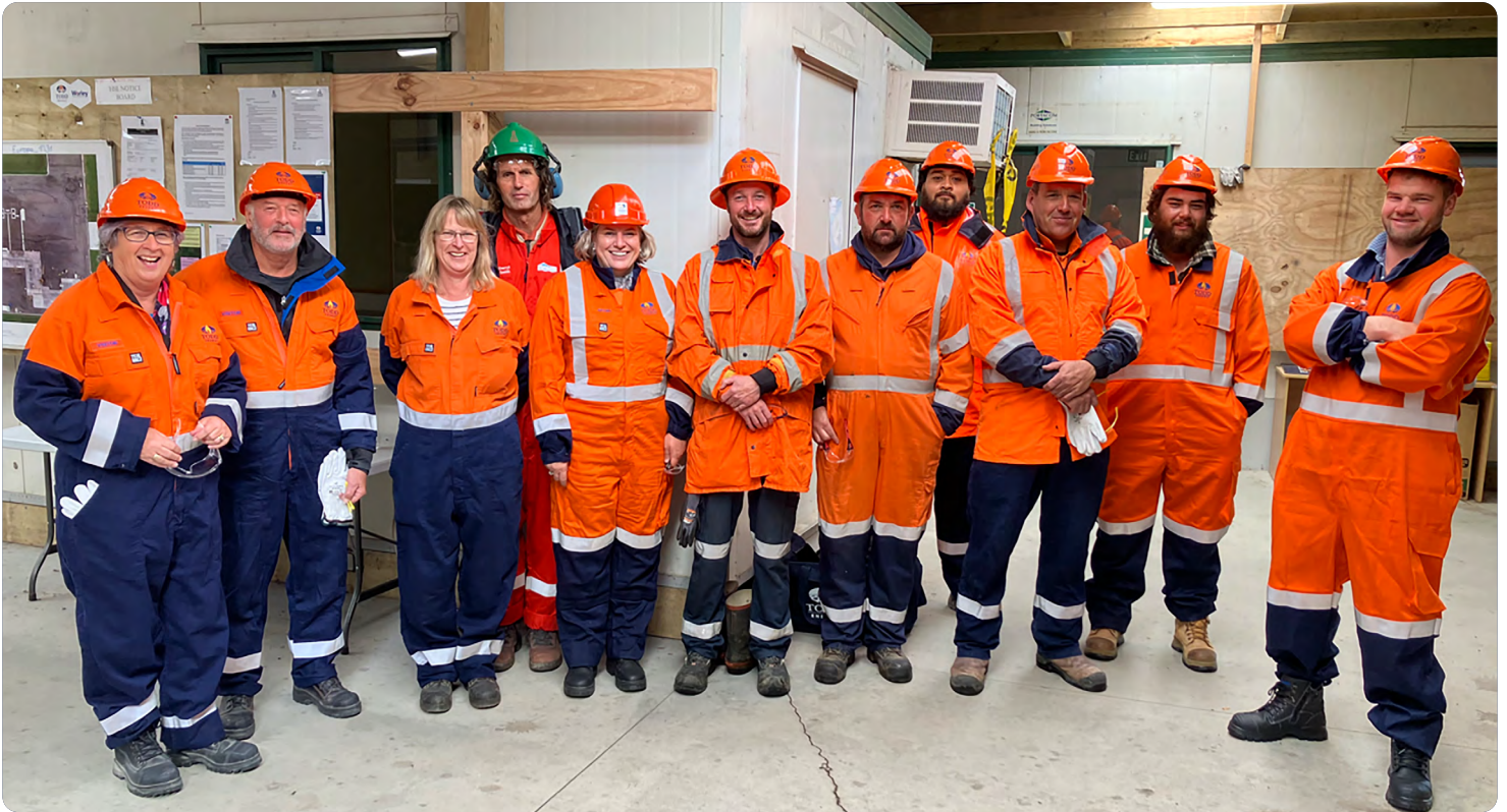
A number of our local neighbours (with some of the Todd Energy team) during their recent visit to our Kapuni J wellsite and rig camp