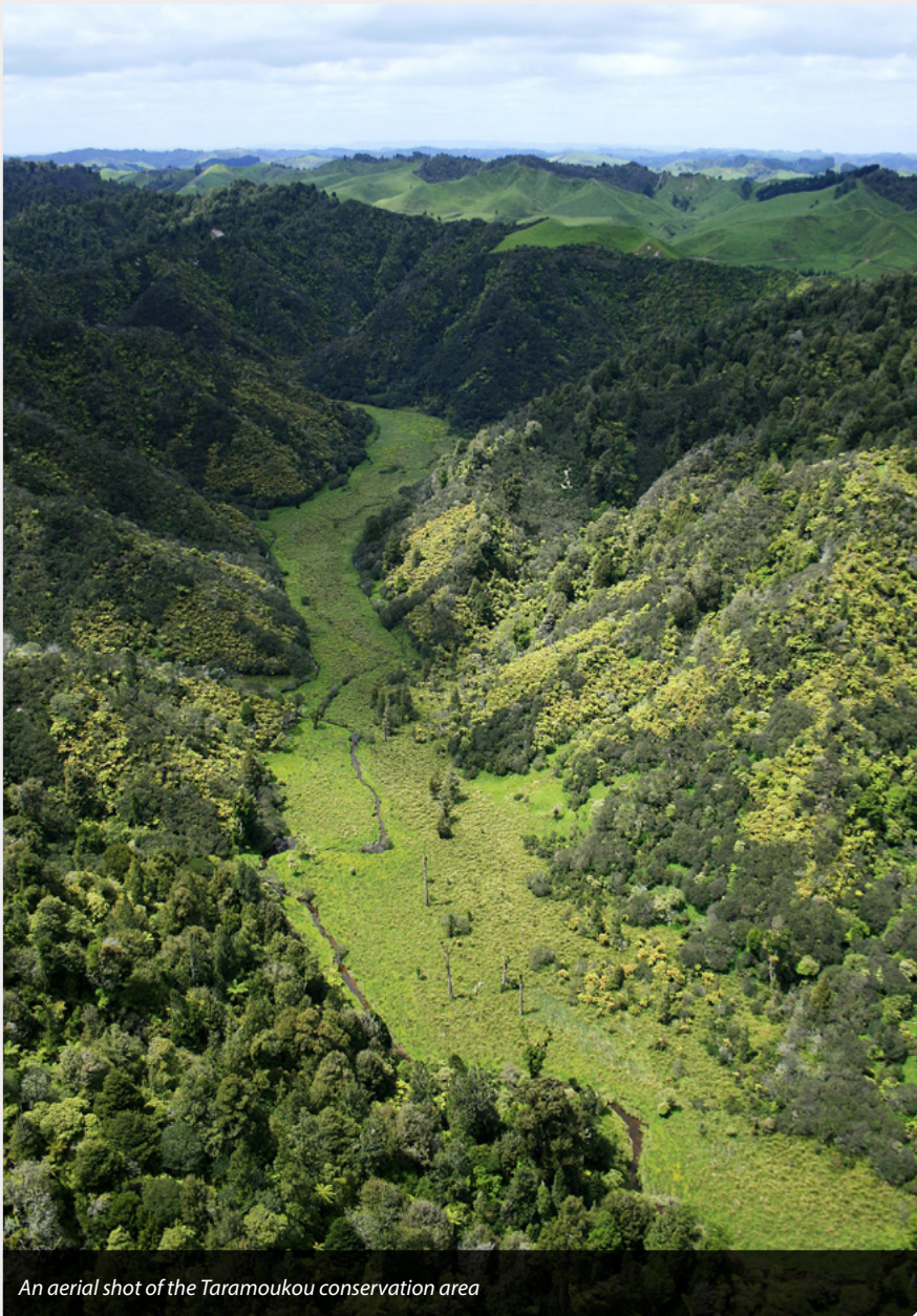
An aerial shot of the Taramoukou conservation area

"We admire their commitment to restoring the natural ecosystem, and fully support their latest predator control activities which are a fantastic continuation of that commitment."