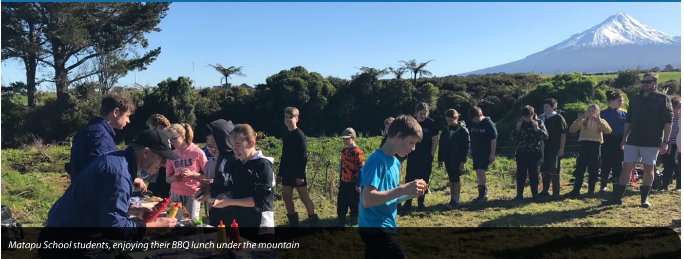
Matapu School students, enjoying their BBQ lunch under the mountain