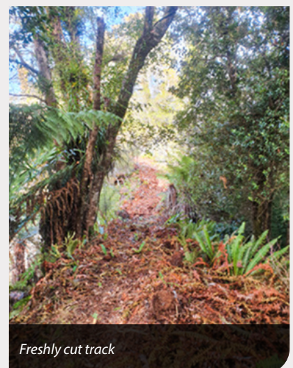
Freshly cut track