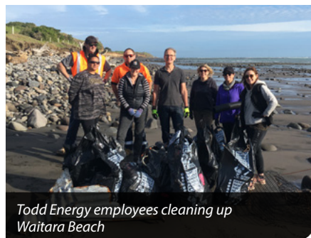
Todd Energy employees cleaning up Waitara Beach

"What started out as a way to join the plastic-free July movement a few years back quickly gained popularity, and it's now something we really look forward to each year."