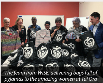
The team from WISE, delivering bags full of pyjamas to the amazing women at Tui Ora