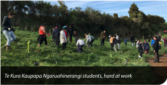
Te Kura Kaupapa Ngaruahinerangi students, hard at work