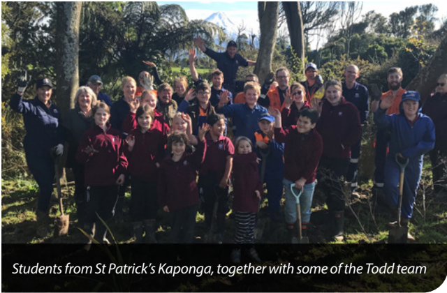
Students from St Patrick's Kaponga, together with some of the Todd team