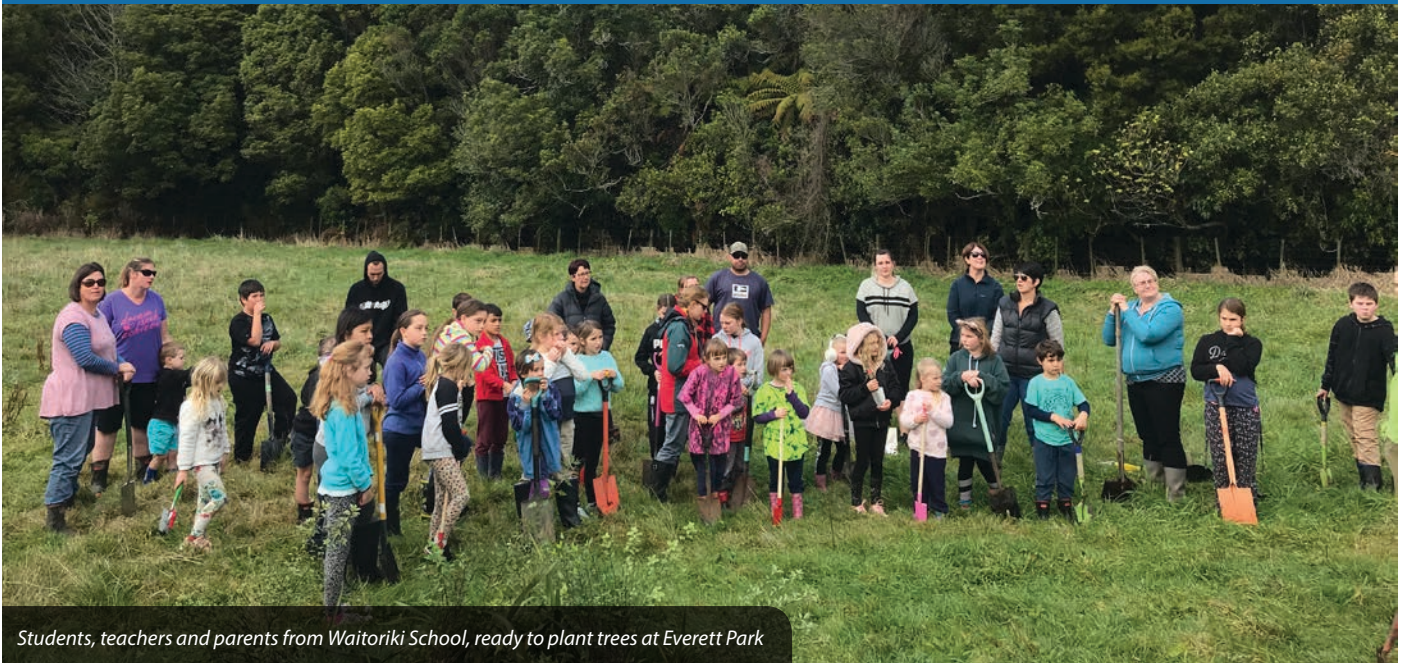
Students, teachers and parents from Waitoriki School, ready to plant trees at Everett Park