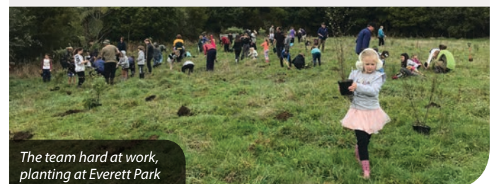
The team hard at work, planting at Everett Park