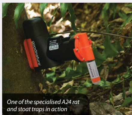
One of the specialised A24 rat and stoat traps in action

our own sites and we're pleased to be supporting local efforts in protecting and enhancing the natural environment with supplying specialised pest traps."