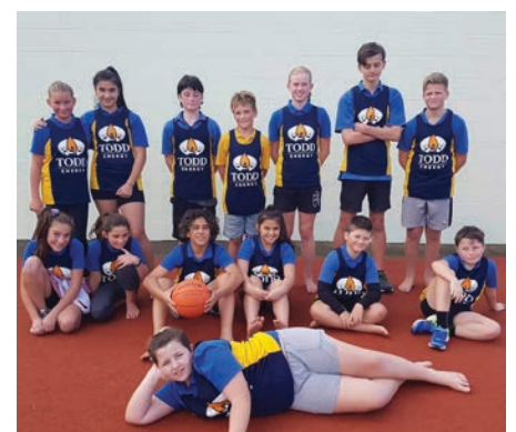
Pembroke School's basketball players in their new Todd-sponsored uniforms

"We enjoy backing local schools, sports clubs and other community groups that contribute to an active and healthy community, and we're pleased the students and the Pembroke School community are happy with their new basketball uniforms, which look fantastic."