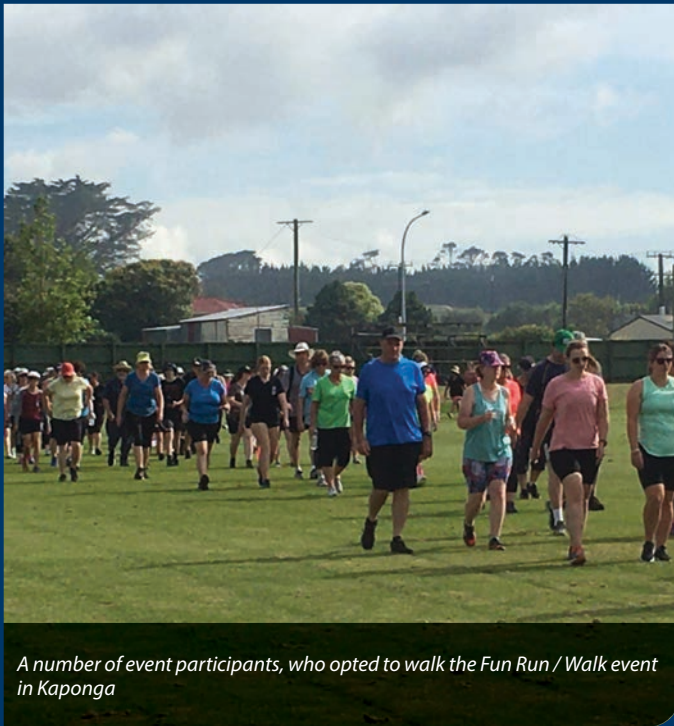
A number of event participants, who opted to walk the Fun Run / Walk event in Kaponga

The timing couldn't have been better for the Taranaki community when they came together for the 2021 Nexans Fun Run / Walk event in Kaponga in mid-February.