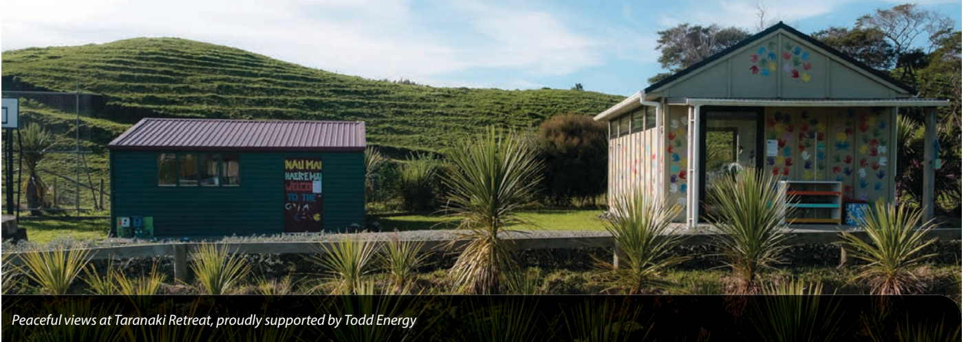
Peaceful views at Taranaki Retreat, proudly supported by Todd Energy