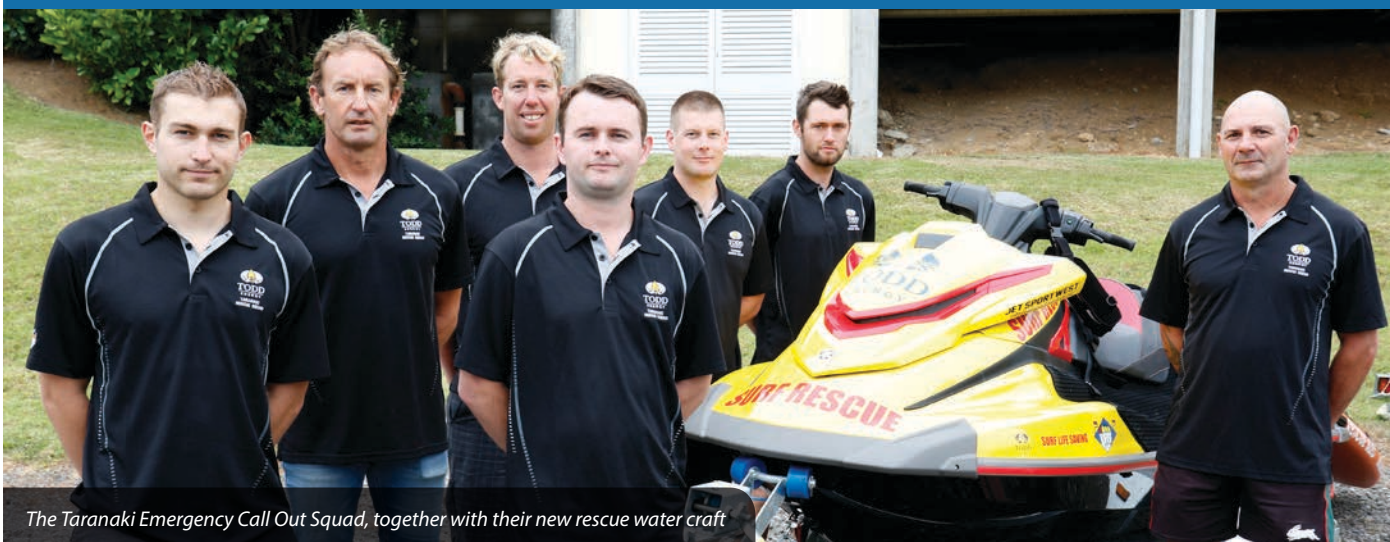
The Taranaki Emergency Call Out Squad, together with their new rescue water craft