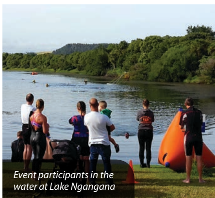
Event participants in the water at Lake Ngangana

“We were thrilled that our support helped make the triathlon and duathlon event accessible to participants from all age groups and abilities, including those who were keen to give triathlon a go for the very first time.”