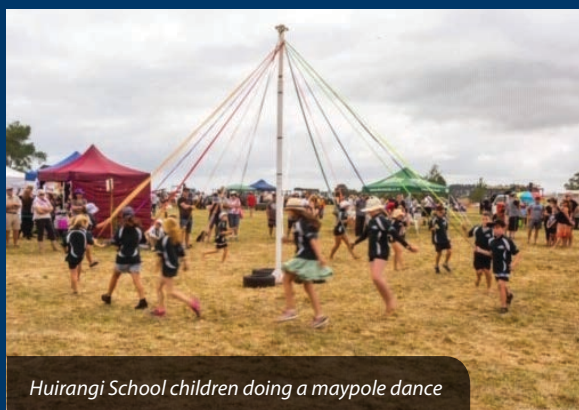
Huirangi School children doing a maypole dance