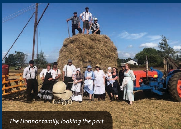
The Honnor family, looking the part

"It's also fantastic knowing the proceeds from the event are going to go back into the community to support local schools and service organisations."