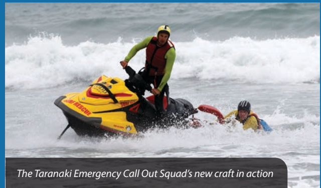
The Taranaki Emergency Call Out Squad's new craft in action

"While IRBs are useful in many rescues, rescue water craft, more commonly known as jet skis, are significantly faster and have different capabilities to IRBs, meaning the Taranaki public can be confident that surf lifeguards have access to the best gear for any water rescue.