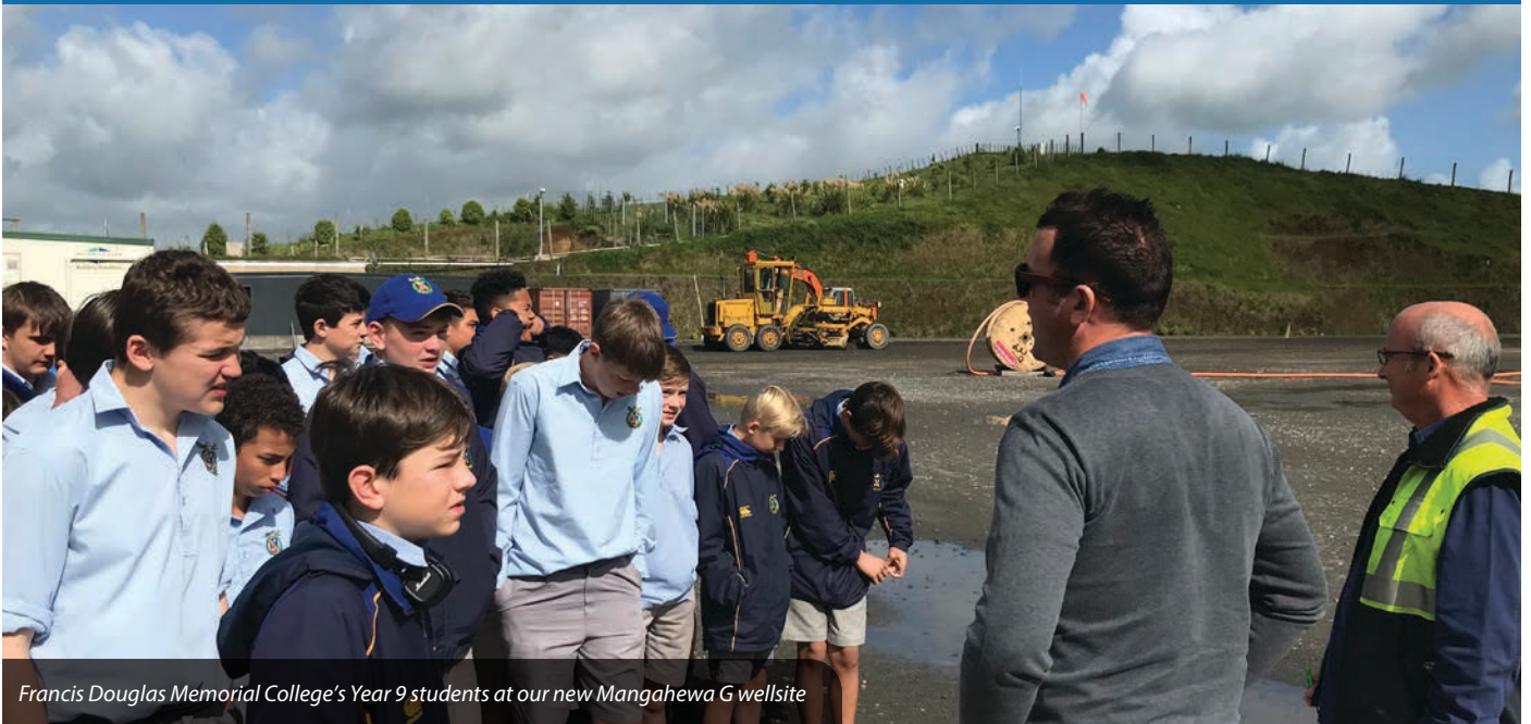
Francis Douglas Memorial College's Year 9 students at our new Mangahewa G wellsite