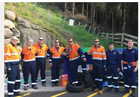
Todd Energy's employees from the McKee Mangahewa Production Station (MMPS), with some of the rubbish they collected

"For the last few years, we've also undertaken an annual beach clean-up at Waitara Beach, where it's great to spread our local clean up to neighbouring communities up and down the Taranaki coastline."