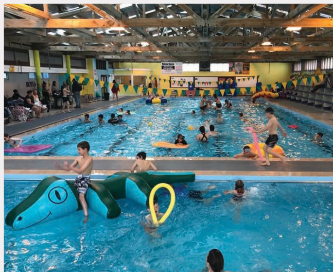
More than 200 people enjoyed Opunake Community Baths' season opening day

"It's important for Todd to help support healthy and active recreational activities, making this fantastic community facility even more accessible to the families that use it."