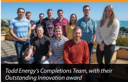
Todd Energy's Completions Team, with their Outstanding Innovation award

During our recent Mangahewa G campaign, Todd managed to reduce flaring by 93%, receiving an award for Outstanding Innovation in industry at