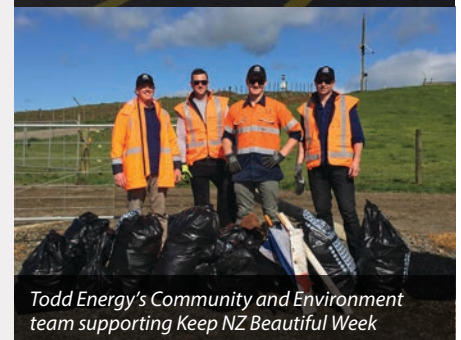
Todd Energy's Community and Environment team supporting Keep NZ Beautiful Week